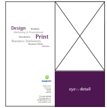
linked file missing from artwork