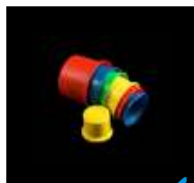
100% black & 40% cyan